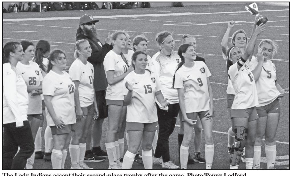
The Lady Indians accept their second-place trophy after the game.